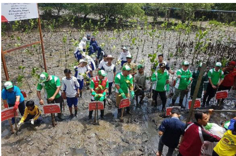
2. Mangrove planting activity led by the City Government of Balikpapan.

From 2013 to 2016, Balikpapan participated in the Urban-LEDS I project as a model city to conduct a greenhouse gas (GHG) emissions inventory and developing a GHG Emission Reduction Plan (RAD-GRK). The city pledged to reduce GHG emissions by almost 20% by 2020 from 2010 levels. In Urban-LEDS Phase II, Balikpapan will focus on promoting vertical integration and strengthening the Measuring, Reporting, Verifying (MRV) processes of its climate action plan.