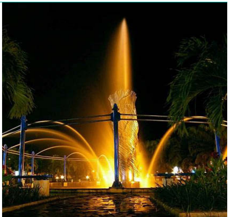
1. Iconic City Symbol of Balikpapan.