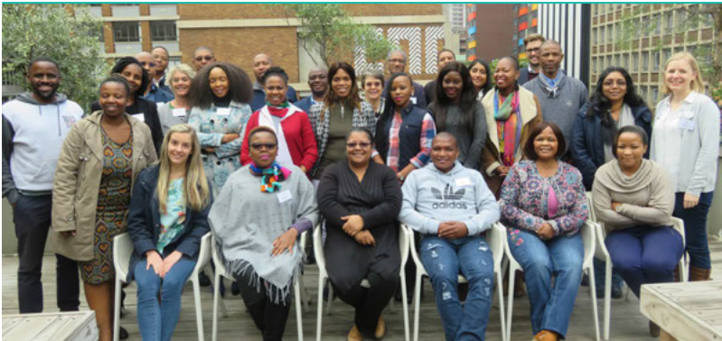
Participants at the Urban-LEDS II Summit: Financing the future we want in the City of Johannesburg, South Africa