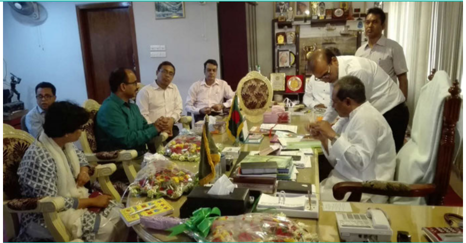
ICLEI South Asia team introducing the Urban-LEDS II project to Honourable Mayor and city officials of Rajshahi city, Bangladesh

Based on the Expression of Interest from cities in Bangladesh, and subsequent discussions, Narayan Ganj and Rajshahi are implementing the project as model cities. Reducing transport emissions, enhancing building energy efficiency and improving solid waste management are some of their stated ambitions. Sirajganj and Singra cities are participating in the project as satellite cities. Read the full story: https://bit.ly/2z0bNWw