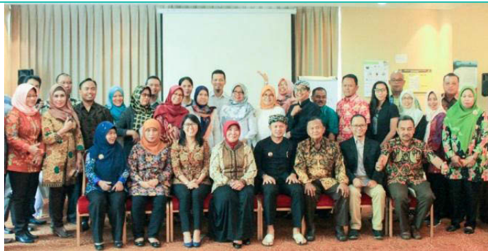
Participants at the Knowledge Management Forum of the Association of Indonesian Municipalities (APEKSI), July 2018

In initial project planning meetings, model cities Bogor and Balikpapan emphasised the need for multi-level governance dialogues on how local governments can contribute to achieving Indonesia's greenhouse gas (GHG) emission reduction target. Read the full story: https://bit.ly/2IKwuJZ