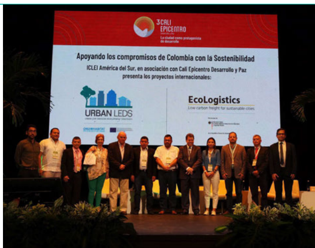
Mayors and representatives of 9 Colombian cities (Metropolitan Area of the Aburrá Valley, Cartago, Envigado, Ibagué, Medellín, Manizales, Santiago de Cali, Tópaga, Valledupar) during the opening of the Cali Epicenter: Peace and Development event.

In February 2018, ICLEI South America opened its first national coordination office in the country. At the occasion, a conference was held on “Sustainable Cities and Low Carbon”, which announced the start of the Urban LEDES project in Colombia. In October 2018, the project was officially launched alongside a technical workshop in which the project was presented and participating cities shared their experiences. See photos of the event: https://goo.gl/7vcfKi